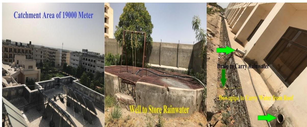
Fig: 3 Components of Infra Structure of Rain Water Harvesting